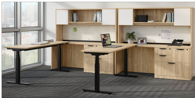
Shown above with aspen finish. PLT tops sold separately.

PLTEAB4872MEDWF24-BLACK PLTEAB4872MEDWF24-SILVER